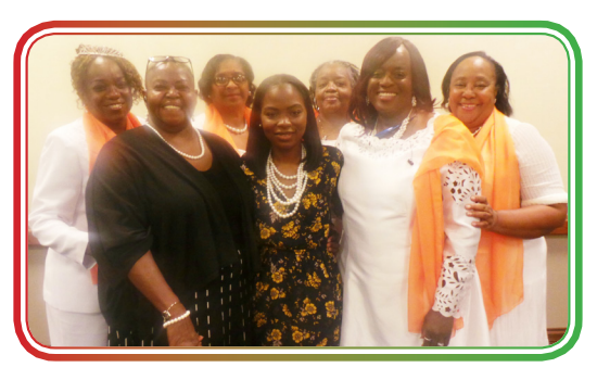
National Convention Florida Delegates