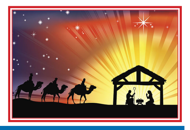
State Deaconess Council President December 2017